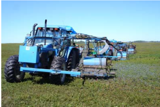
Wild blueberry mechanical harvesters.

Lowbush blueberries are harvested in once over picking operation. They are harvested either by hand raking, using a metal rake or by mechanical harvesters. Harvest begins in late July or early August, when most of the berries are ripe. The raking season normally lasts up to Labor Day. Mechanical harvesters have increased in use because of improvements in harvesters and field conditions and are now used on 80% of the fields Maine.